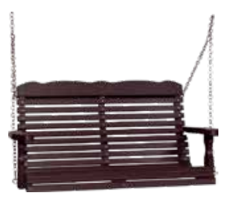
#205 - 4' Swing