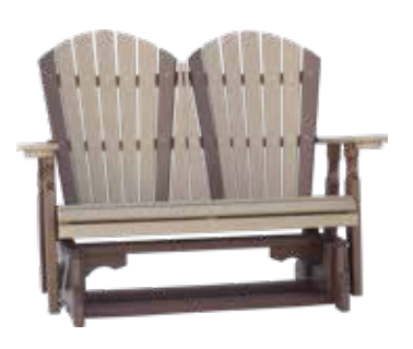
#504 - 4' Glider Weathered Wood/Tudor Brown