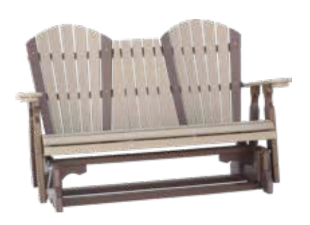
#508 - 5' Glider Weathered Wood/Tudor Brown