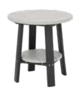
#417 - 21" Round End Table Dove Gray/Black