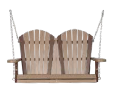
#505 - 4' Swing Weathered Wood/Tudor Brown