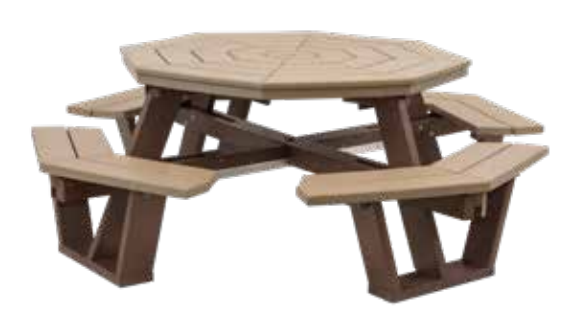
#700 - 5' Octagon Picnic Table Weathered Wood/Tudor Brown