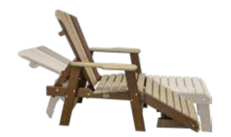
#506 - Chaise Lounge Weathered Wood/Tudor Brown