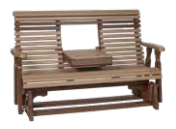
#111 - 5' Glider w/ Pullout Weathered Wood/Tudor Brown