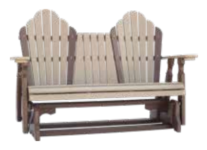
#908 - 5' Glider Weathered Wood/Tudor Brown