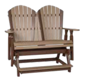
#504CH - 4' Counter Glider Weathered Wood/Tudor Brown