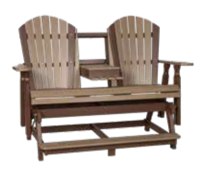
#508CH - 5' Counter Glider w/ Pullout Weathered Wood/Tudor Brown