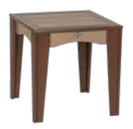
#422 - Square End Table Weathered Wood/Tudor Brown