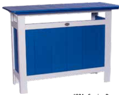
#824 - Serving Bar Blue/White