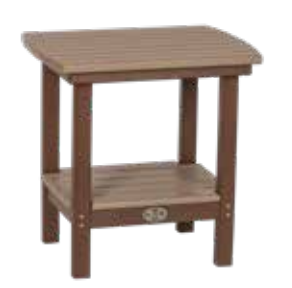
#402 - Deluxe End Table Weathered Wood/Tudor Brown