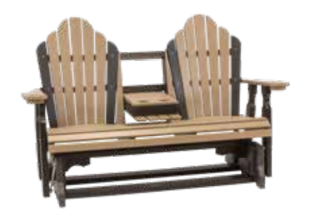
#908A - 5' Glider w/Pullout Weathered Wood/Black