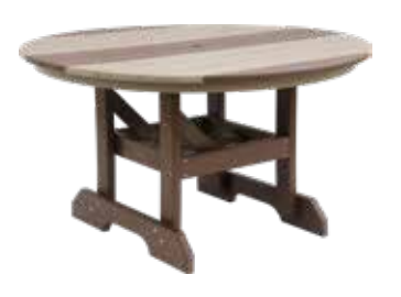
54" Round Table Dining, counter and bar heights Weathered Wood/Tudor Brown