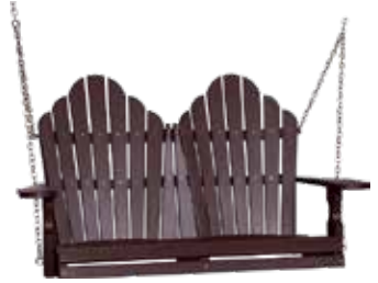
#905 - 4' Swing Tudor Brown