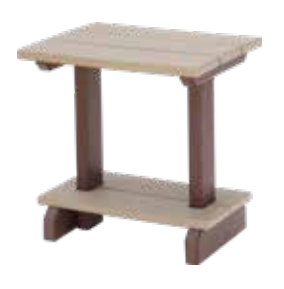
#400 - 17" x 20" End Table Weathered Wood/Tudor Brown