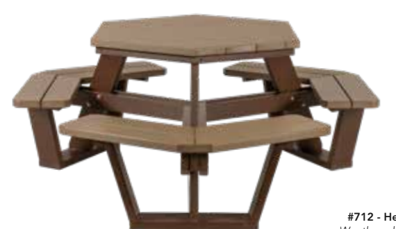
#712 - Hexagon Picnic Table Weathered Wood/Tudor Brown