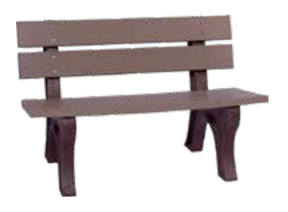
#710 - 48" Park Bench Weathered Wood/Tudor Brown