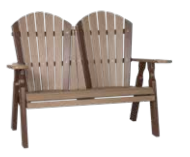
#503 - 4' Loveseat Weathered Wood/Tudor Brown