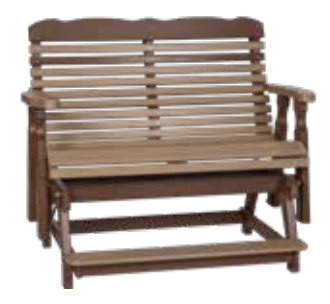
#204Ch - 4' Counter Glider Weathered Wood/Tudor Brown