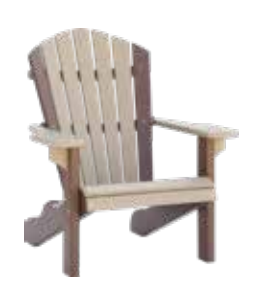
#501 - 22" Beach Chair Weathered Wood/Tudor Brown