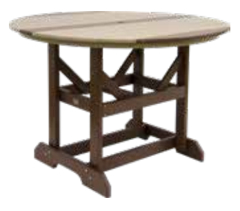
60" Round Table Dining, counter and bar heights Weathered Wood/Tudor Brown