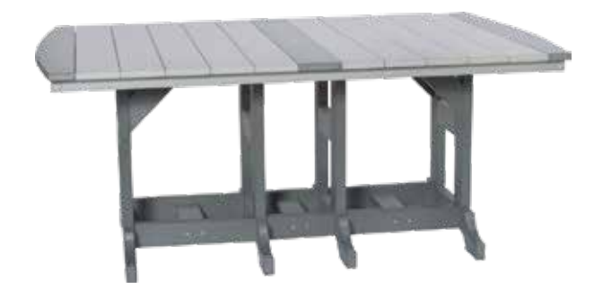
#412 - 6' Dining Table Dove Gray/Dark Gray