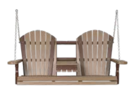
#511A - 5' Swing w/ Pullout Weathered Wood/Tudor Brown