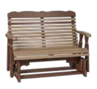
#204 - 4' Glider Weathered Wood/Tudor Brown