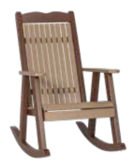
#826 - Porch Rocker Weathered Wood/Tudor Brown