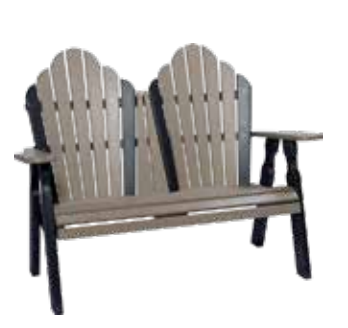
#903 - 4' Loveseat Weathered Wood/Black