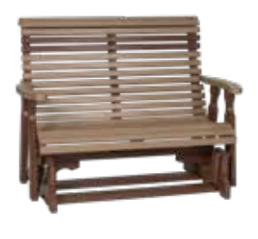
#104 - 4' Glider Weathered Wood/Tudor Brown