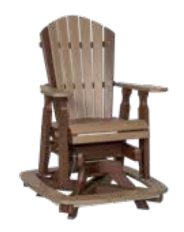
#510CH - Counter Swivel Glider Weathered Wood/Tudor Brown