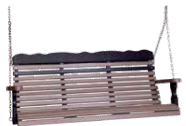
#208 - 5' Swing Weathered Wood/Black