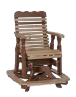
#210CH - 22" Counter Swivel Glider Weathered Wood/ Tudor Brown