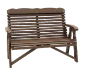
#203 - 4' Loveseat Tudor Brown