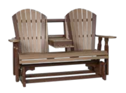
#508A - 5' Glider w/ Pullout Weathered Wood/Tudor Brown