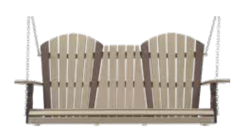
#511 - 5' Swing Weathered Wood/Tudor Brown