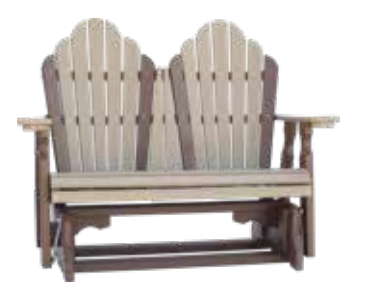
#904 - 4' Glider Weathered Wood/Tudor Brown