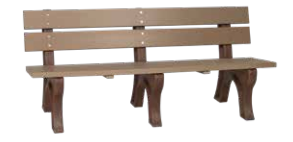
#711 - 72" Park Bench Weathered Wood/Tudor Brown